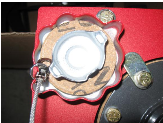
FUEL CELL CAP GASKET